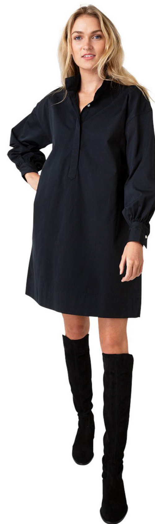
ANAYA POPOVER DRESS IN BLACK POPLIN $325/Sale $260