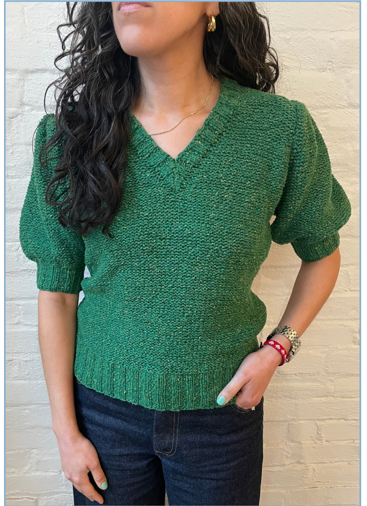
GISELLE V-NECK SWEATER IN RAINFOREST $295/ Sale $236