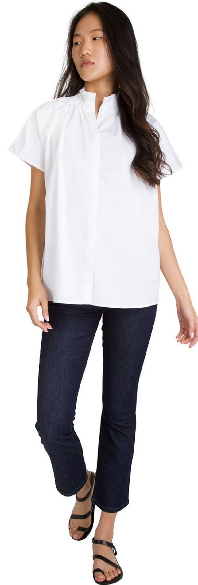
ATELIER KAMI TOP IN WHITE POPLIN $350/ Sale $280