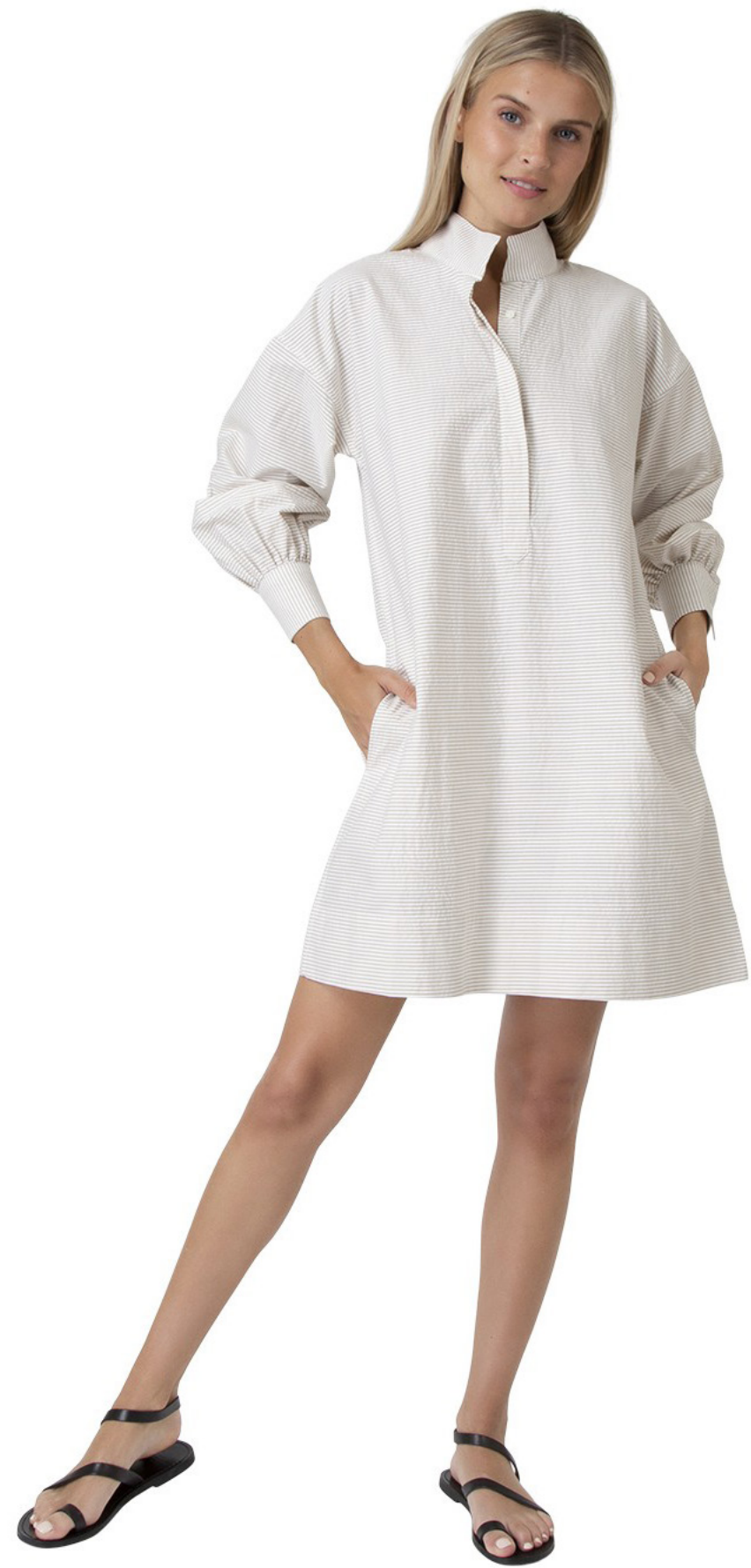
ANAYA POPOVER DRESS IN TAUPE HORIZONTAL STRIPE SEERSUCKER $325/ Sale $260