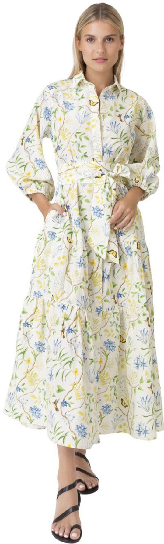
ISLA SHIRT DRESS IN ENCHANTED GARDEN $595/ Sale $476