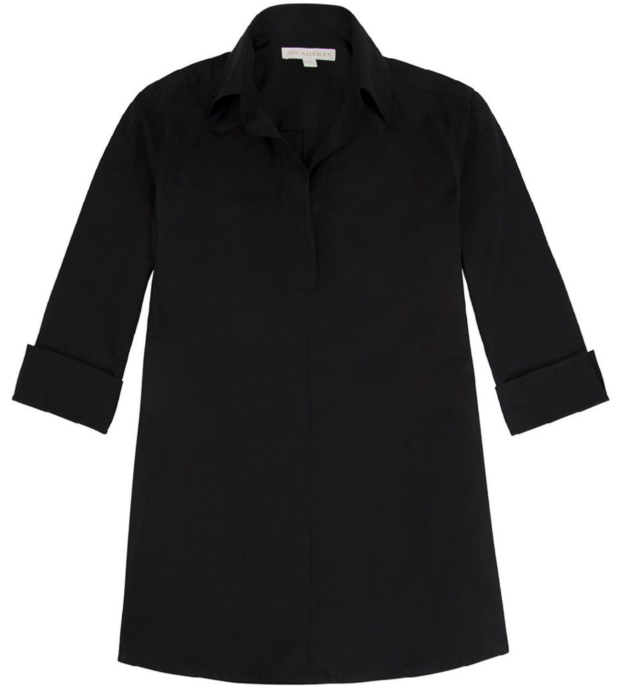
DESIGNER TUNIC IN BLACK POPLIN $175/ Sale $140