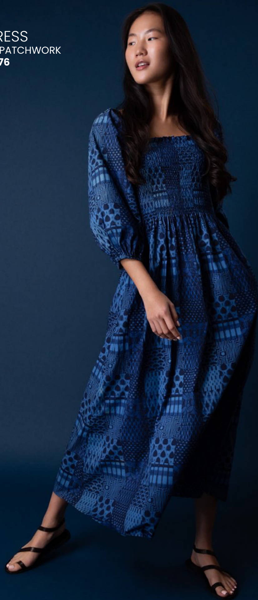
ANDRA DRESS IN BLUE/NAVY PATCHWORK $595/Sale $476