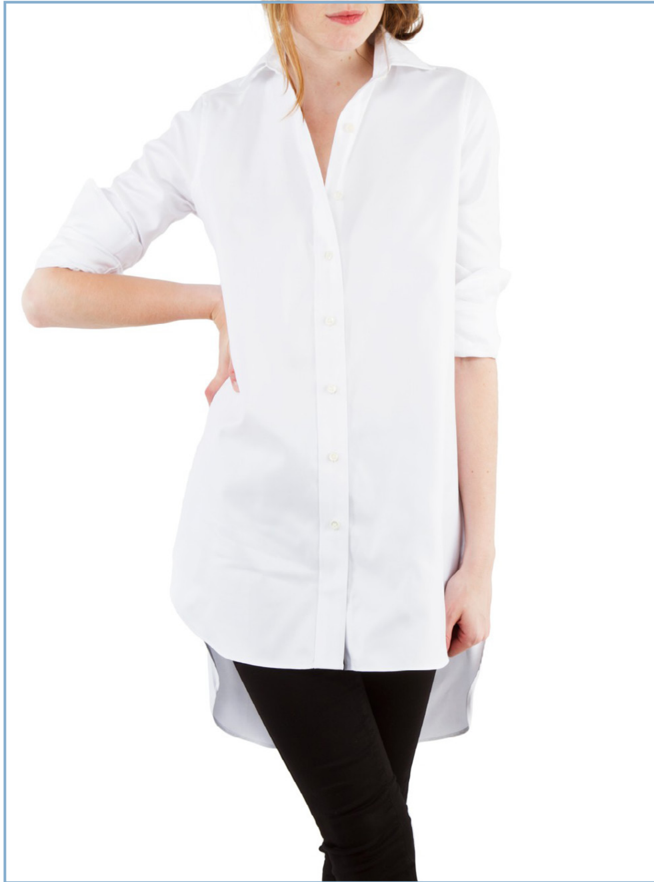
DIRECTOR SHIRT IN WHITE ROXFORD $195/ Sale $156