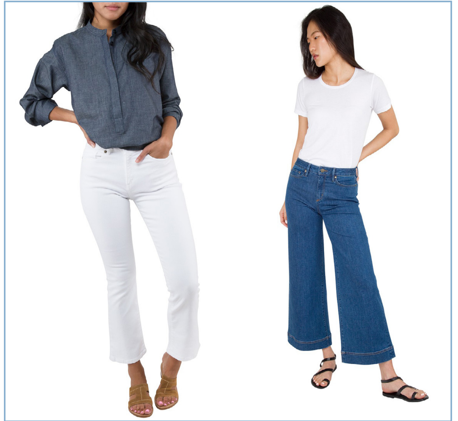
FLARE CROPPED 5-POCKET JEAN IN WHITE DENIM $195/ Sale $156