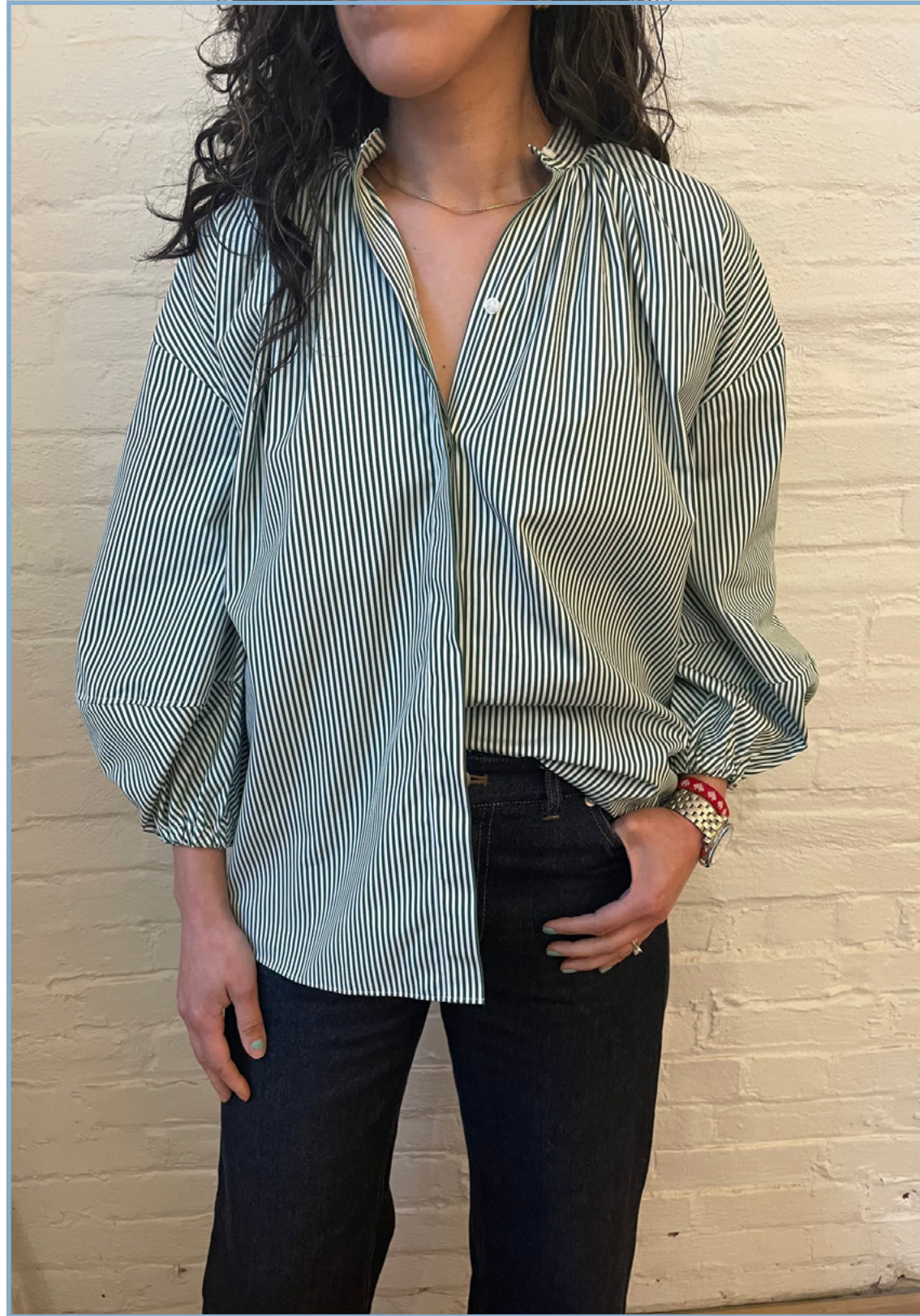
MERYL SHIRT IN FOREST BENGAL STRIPE $250/ Sale $200