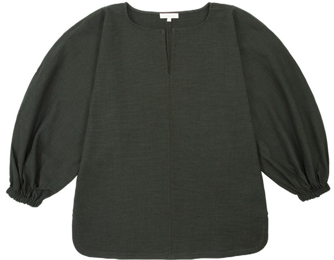
ELORA VOLUME TOP IN DARK OLIVE $350/ Sale $280