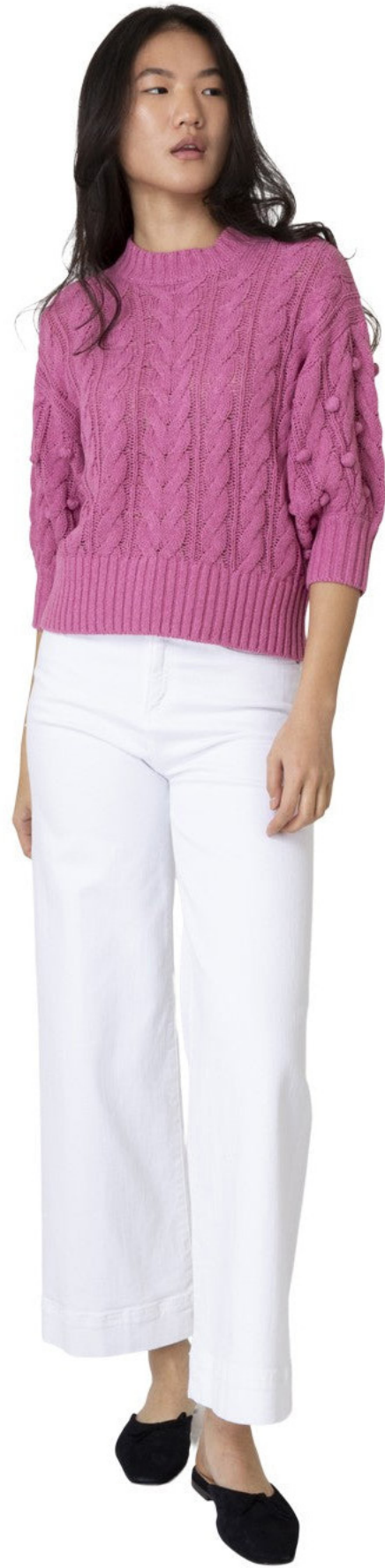
SHORT SLEEVE ANALISE SWEATER IN PINK $295/ Sale $236