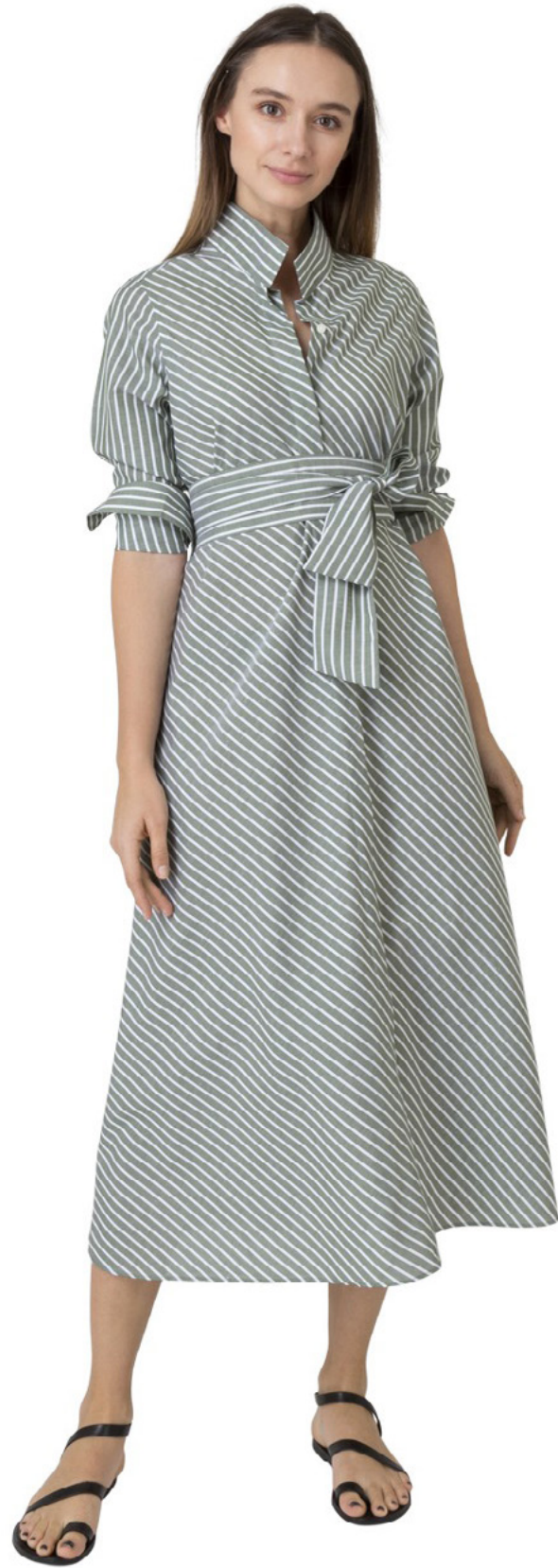
ANNETTE DRESS IN OLIVE STRIPE $395/Sale $316