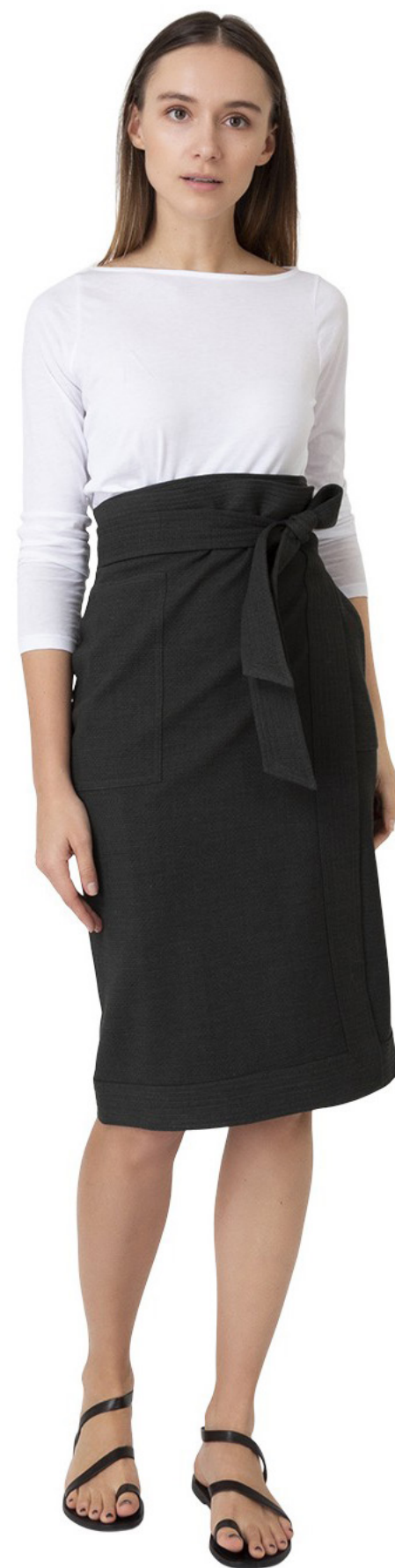
KIRA WRAP SKIRT IN DARK OLIVE WAFFLE $395/ Sale $316