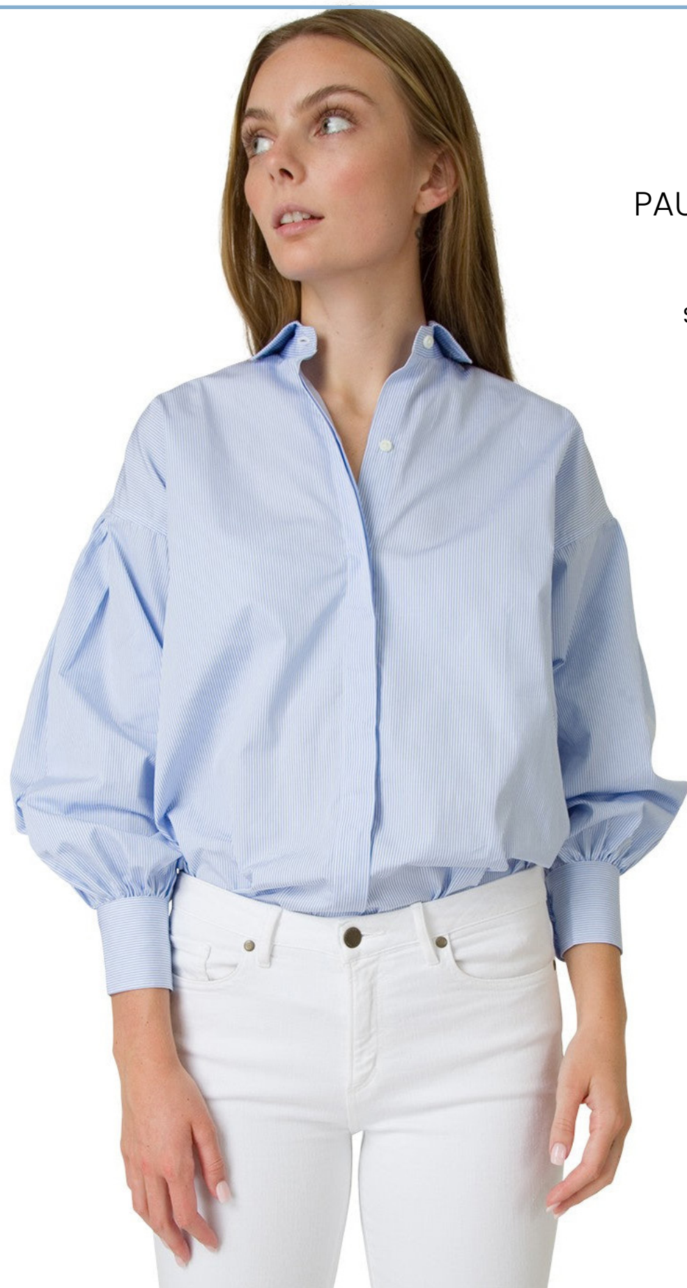
PAULINA SHIRT IN SKY SMALL BENGAL STRIPE & WHITE $250/ Sale $200