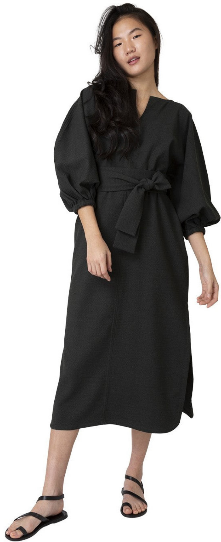
ELORA VOLUME DRESS IN DARKE OLIVE WAFFLE CREPE $495/ Sale $396