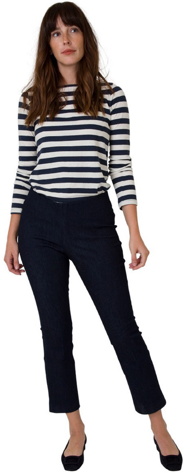
FAYE FLARED CROP PANT IN INDIGO, KHAKI AND BLACK $250-$275/ Sale $200-$220