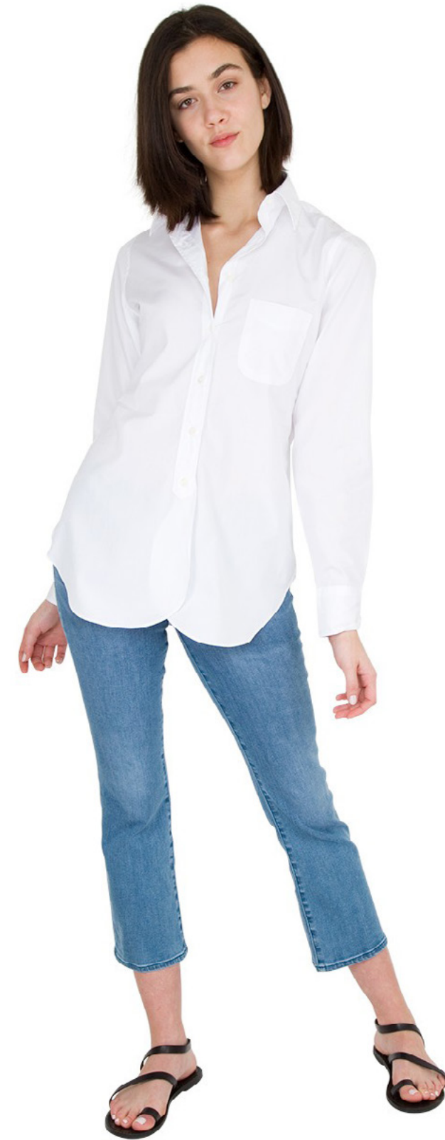
BOYFRIEND SHIRT IN WHITE POPLIN $175/ Sale $140