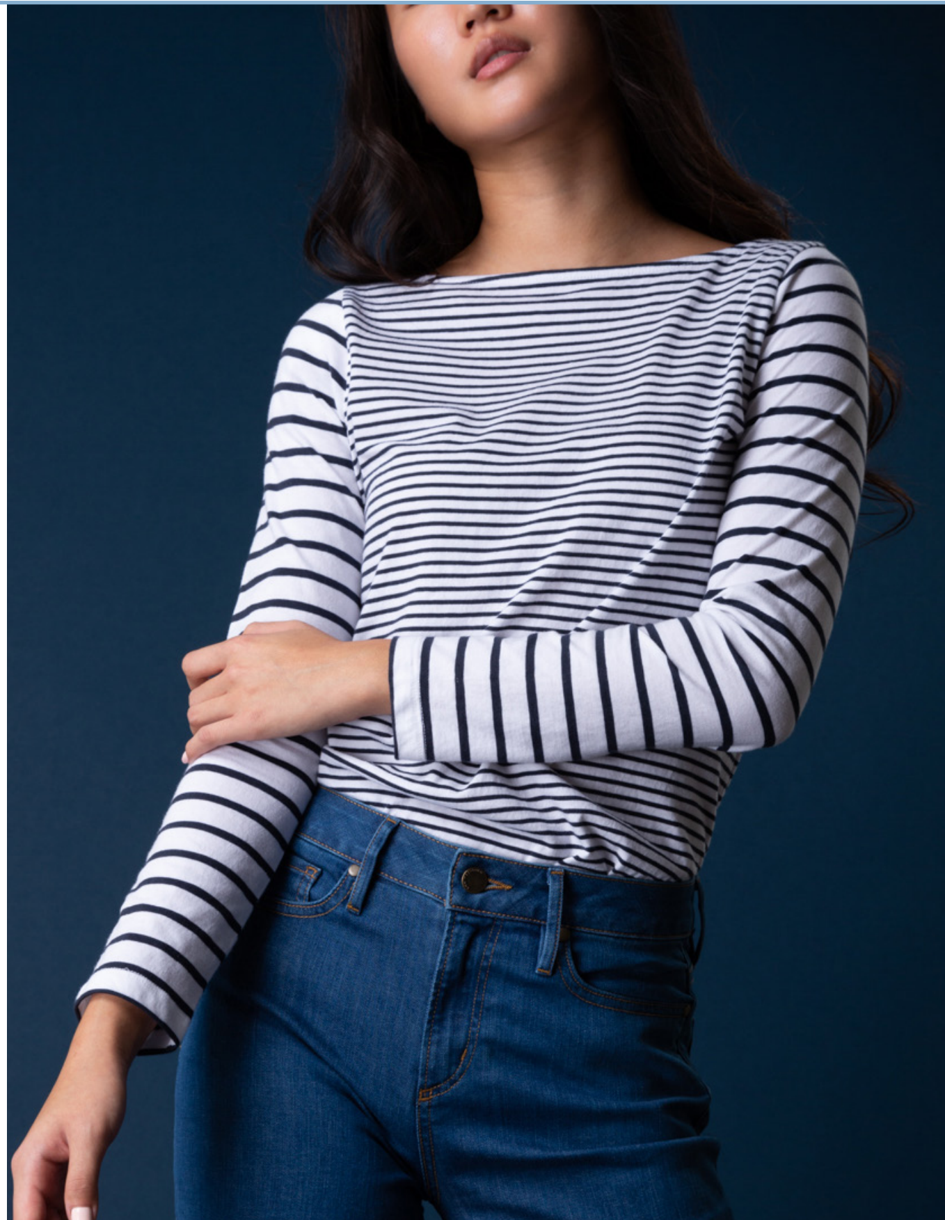
LONG SLEEVE BOAT NECK TEE IN NAVY MULTI STRIPE $95/ SALE $76