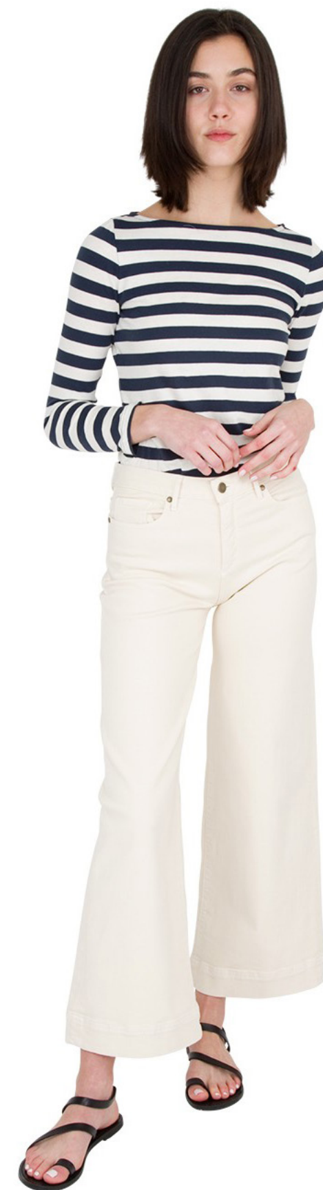
WIDE LEG CROPPED 5-POCKET JEAN IN NATURAL DENIM $195/ Sale $156