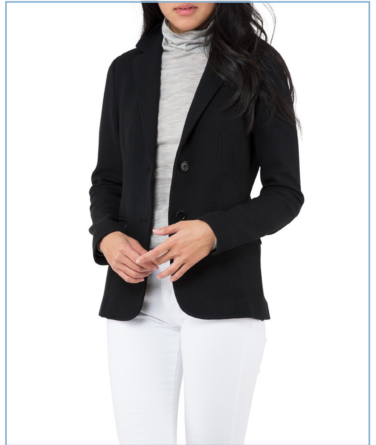
UNCONSTRUCTED JACKET IN BLACK WOOL PIQUE $595/ Sale $476