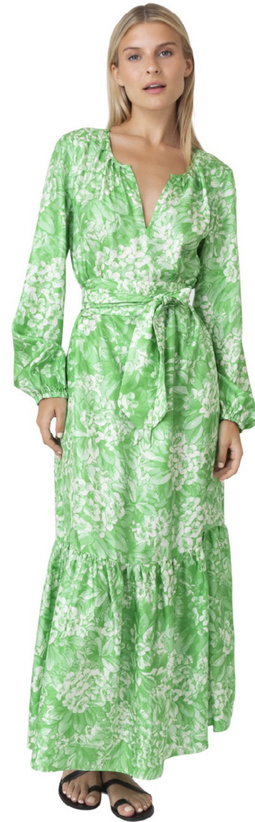
ABA MAXI DRESS IN GREEN HYDRANGEA $696/Sale $557