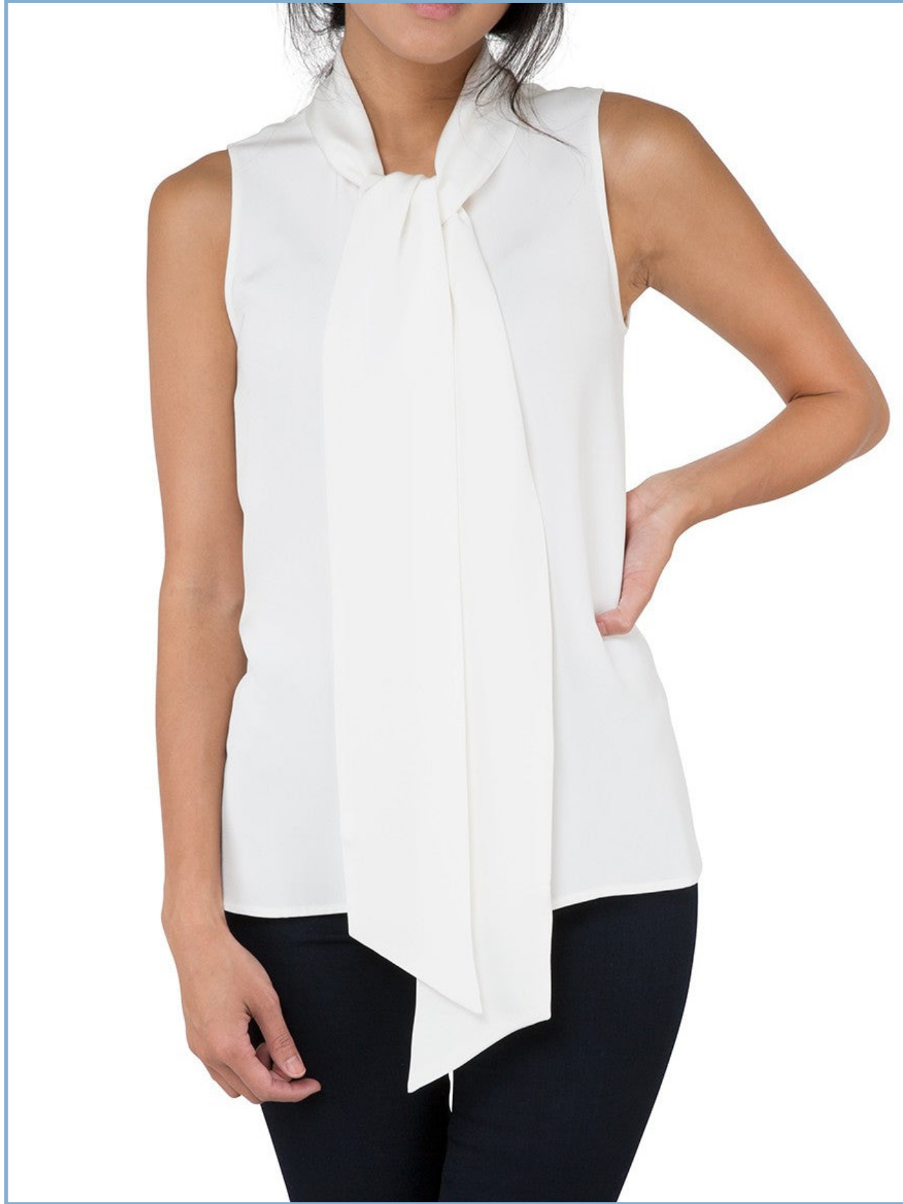
SLEEVELESS TIE NECK BLOUSE IN IVORY SILK $350/ Sale $280