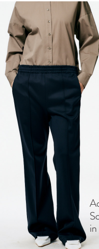
Active Knit Scottie Jogger in Navy $425