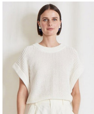
Oliva Linen Vest in Cream $365