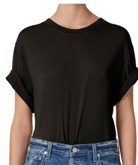
Lupita Tee in Black $128