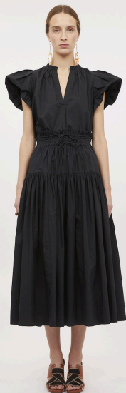
Evelyn Top in Noir $220