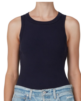
Isabel Rib Tank in Fig & Navy $98