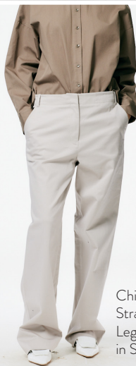
Chino Rodney Straight Leg Trousers in Stone $395