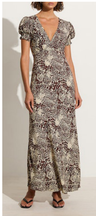
Reid Midi Dress in Salamanca $209