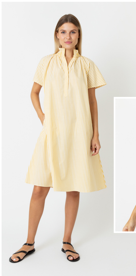
Atelier Kami Volume Dress in Golden/Natural Chambray Stripe $395