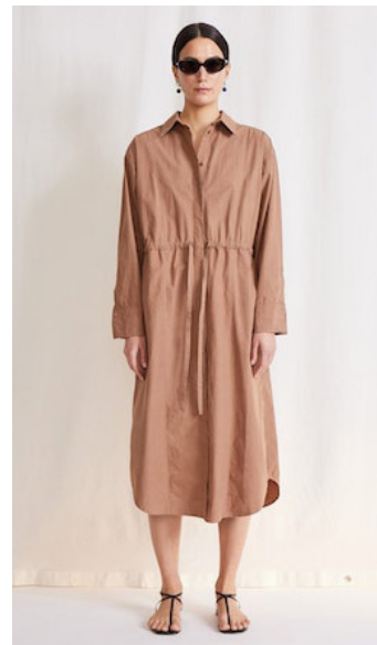
Molto Shirt Dress in Deep Khaki $425