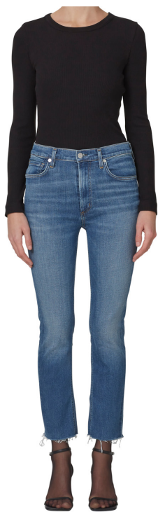
Isola Straight Crop in Lawless $228