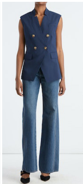
Amika Vest in Marine $548