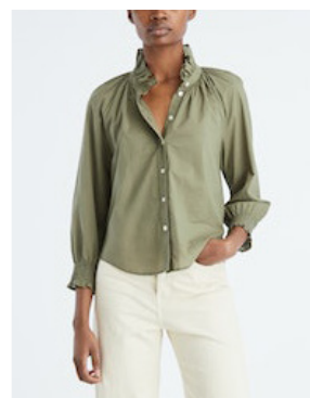
Calisto Shirt in Marine $248