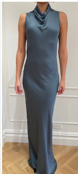
Jura Dress in Lagoon Blue