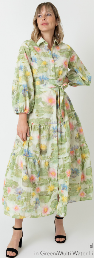
Isla Shirtdress in Green/Multi Water Lilies Habotai $695