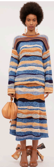
Francie Pullover in Aegean $490