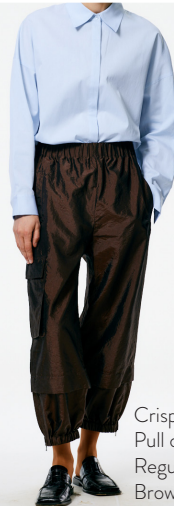
Crispy Nylon Wilt Pull on Jogger Regular in Long Brown $395