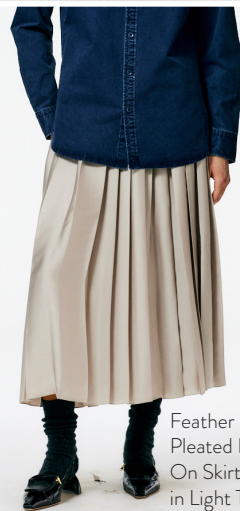
Feather Light Pleated Pull On Skirt in Light Tan $495