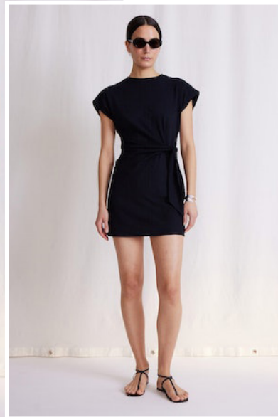
Nina Cinched Mini in Black $215