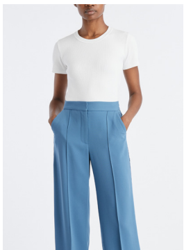
Pruitt Tee in White $158