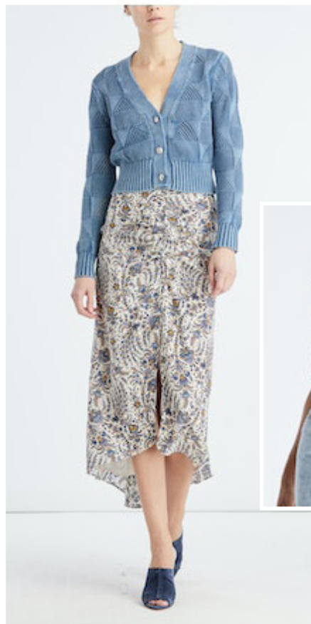
Mirembe Cardigan in Blue $378 Pixie Skirt in Ecru Multi $498