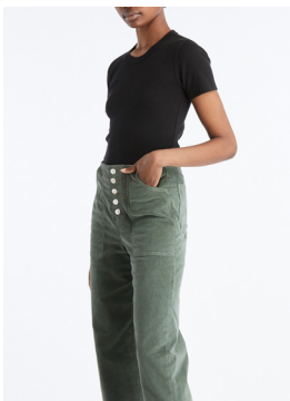
Pruitt Tee in Black $158