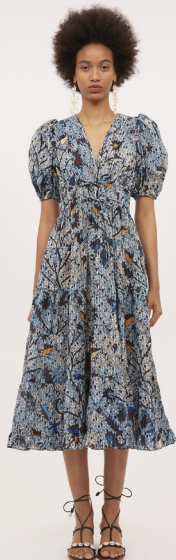
Thelma Dress in Jet $490