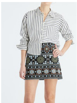
Aderes Shirt in Mrnow $378