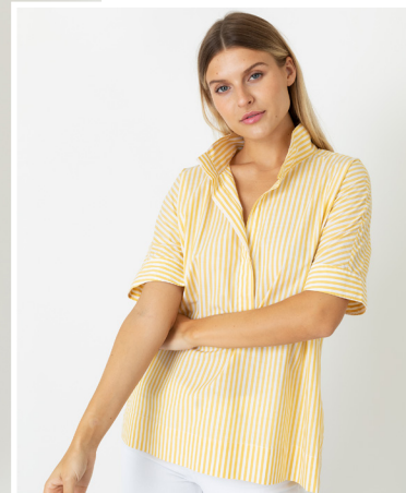
Soliel Shirt in Gold/Natural Chambray Stripe $275