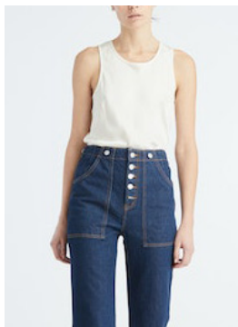
Sabrina Tank in Off White $268