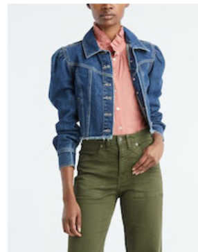
Sweeney Jacket in Second Chance $448