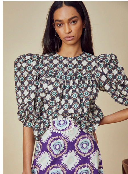
Millie Top in London Rain Cream $365