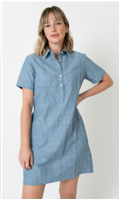
Short-Sleeved Popover Dress in Extra Light Washed Cotelino Chambray $295