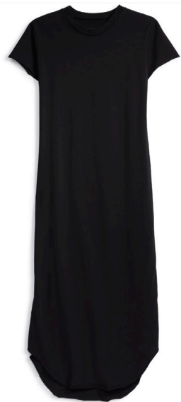
Harper-Perfect Tee Maxi Dress in Black $188