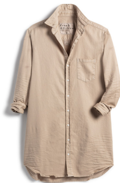
Classic Shirdress in Sand Tattered Denim $328