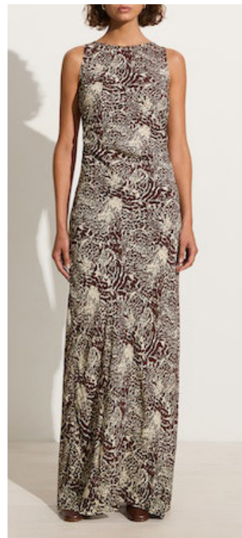
Clementine Midi Dress in Salamanca $209