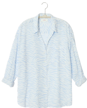
Sydney Shirt in Blue Wave $221