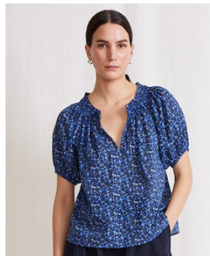
Esparta Short Sleeve in Spagliato Floral $265