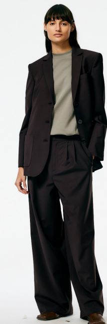
Tropical Wool Stella Pant in Dark Brown $495