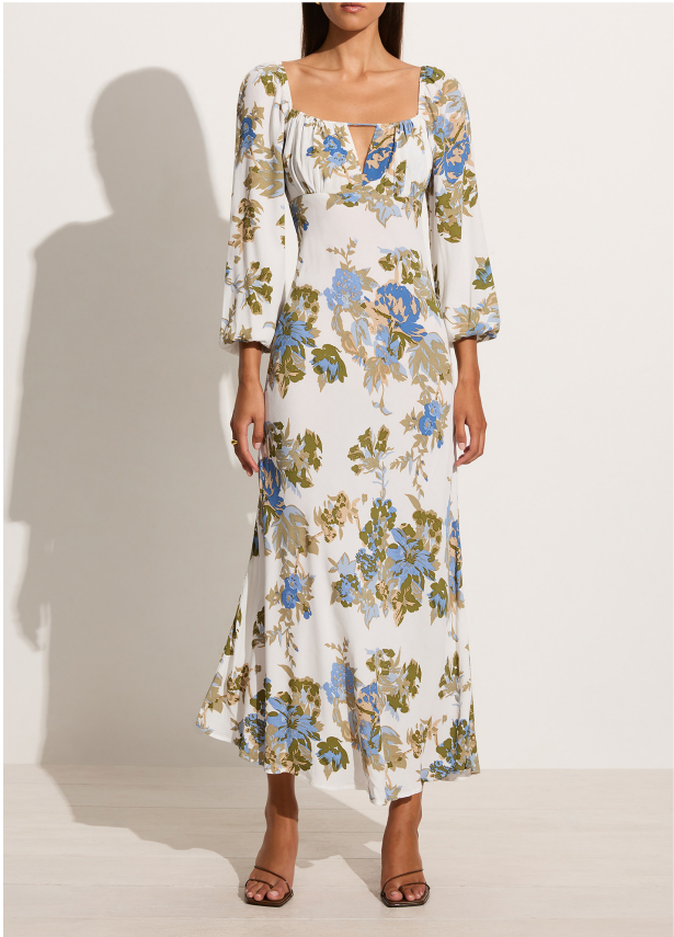
Benedita Midi Dress in Escala Floral Ivory $289