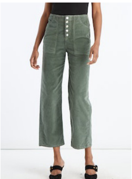
Crosbie Cord Cropped Wide Leg in Garden Topiary $278