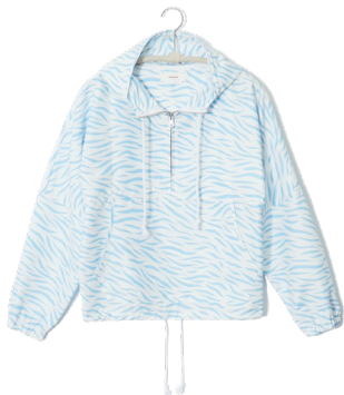
Ellery Jacket in Blue Wave $215