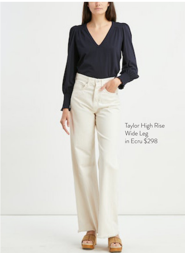
Taylor High Rise Wide Leg in Ecru $298