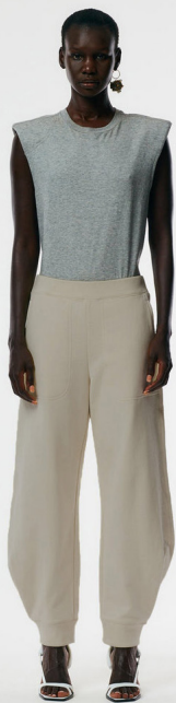
Sweatshirt Program Calder Longer Sweatpant in Cement & Black $198