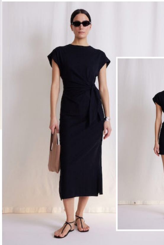
Vanina Cinches Waist Dress in Black $255