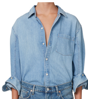
Kayla Shrunken in Tide $228