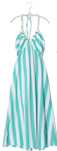
Maggie Dress in Julep Stripe $280