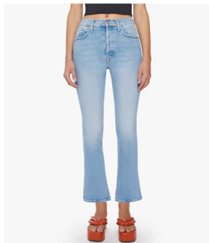
The Tripper Ankle in Cat Daddy $238