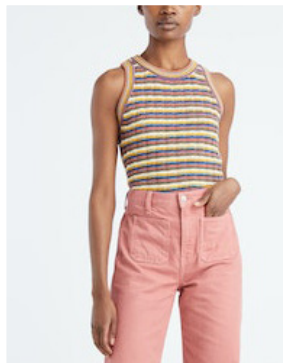
Jerrel Knit Tank in Stripe $298