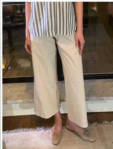
Fallon Pull on Pant in Sand Garment Dyed Stretch Poplin $275