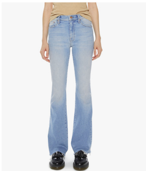
The Weekender Fray in California Cruiser $238