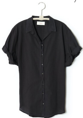
Channing Shirt in Black $175