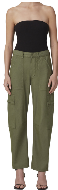
Marcelle Low Slung Cargo in Surplus $248