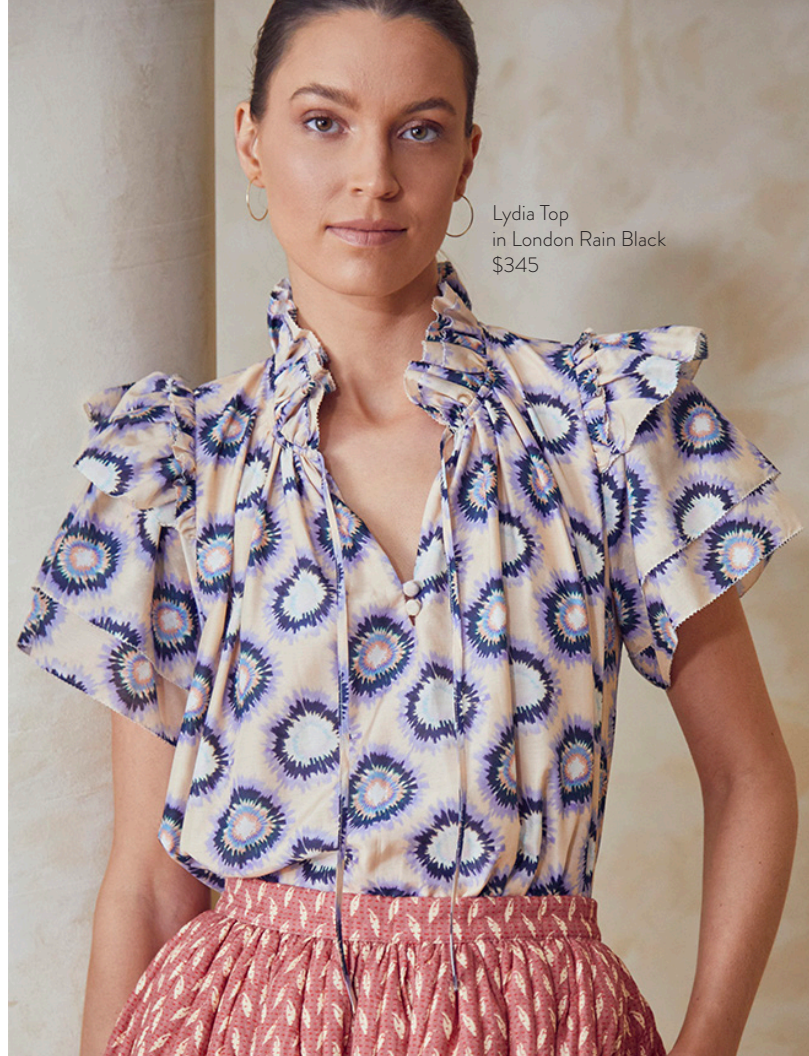
Lydia Top in London Rain Black $345