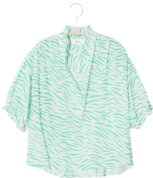
Cam Top in Sea Mist $198