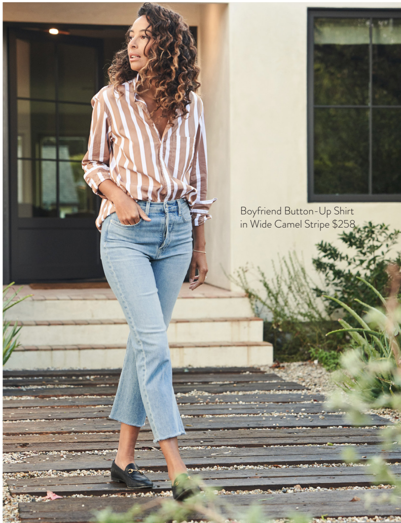
Boyfriend Button-Up Shirt in Wide Camel Stripe $258