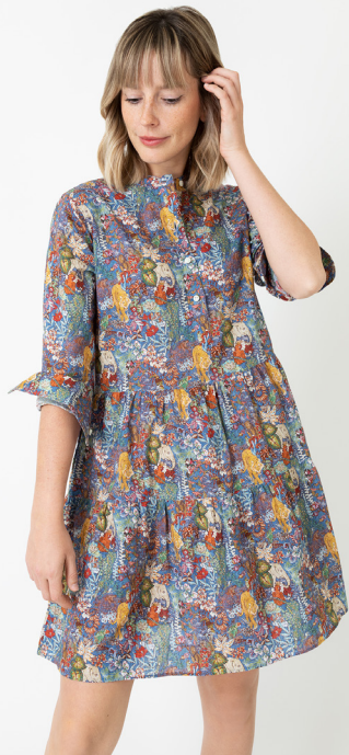
Ali Tier Shirtdress in Blue Multi Jungle Print $395