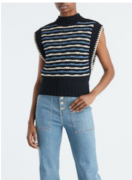
Tarina Sweater Vest in Navy Multi $428