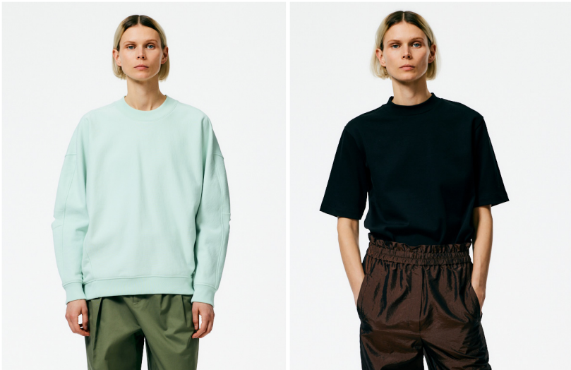
Sweatshirt Program Cocoon Crewneck Sweatshirt in Mint $295