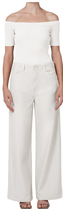
Paloma Utility Trousers in Oysterette $248