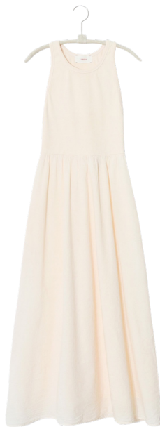
Flynn Dress in Spearmint $225