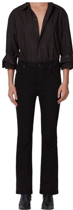
Lilah 30 in Plush Black $208