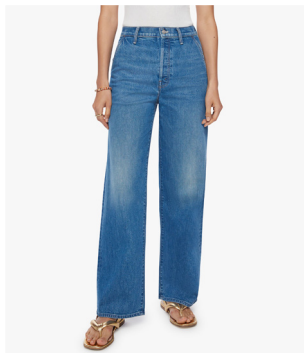
HW Spinner Prep Skimp in Flashback $298