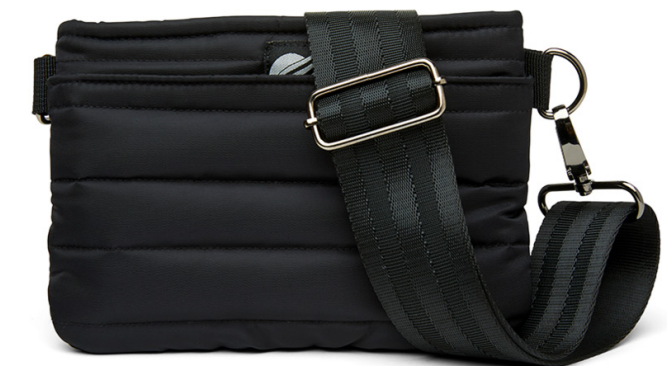
The Bum Bag in Black Camo, Mushroom, Chocolate, Black Flight | $78