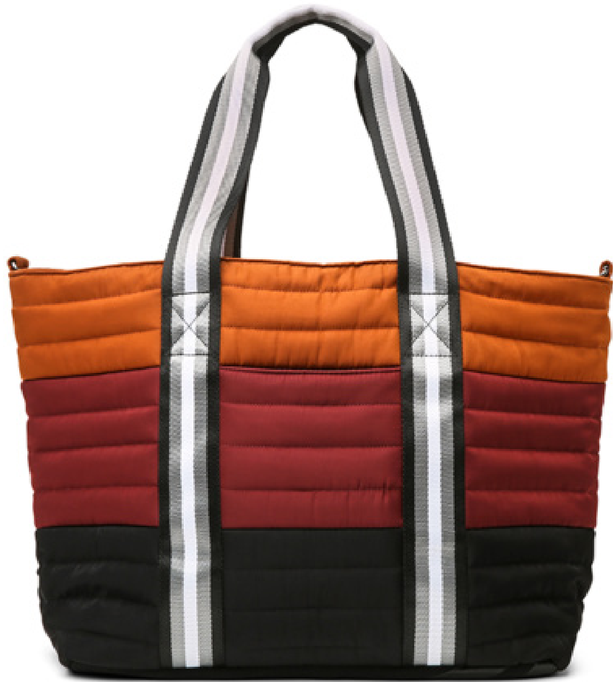
Wingman Bag in Sunset Colorblock | $178