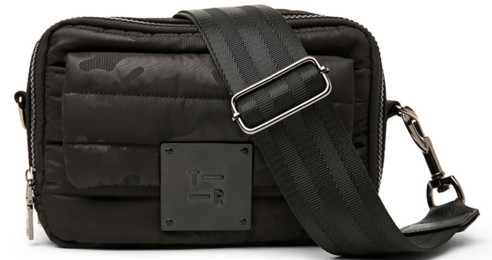
Star Bag in Pearl Pyrite and Black Camo | $148