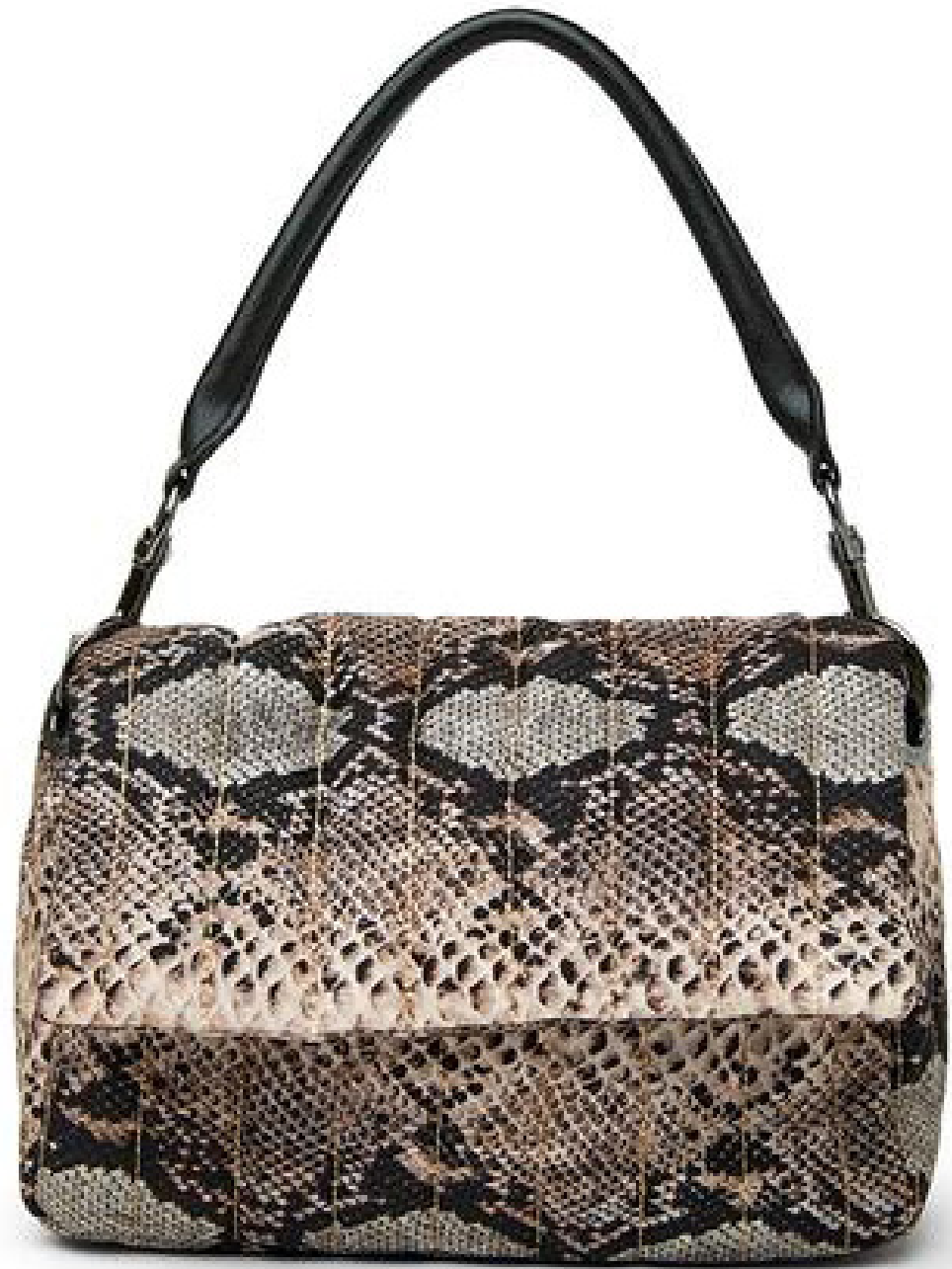
Bar Bag in Natural Python | $158