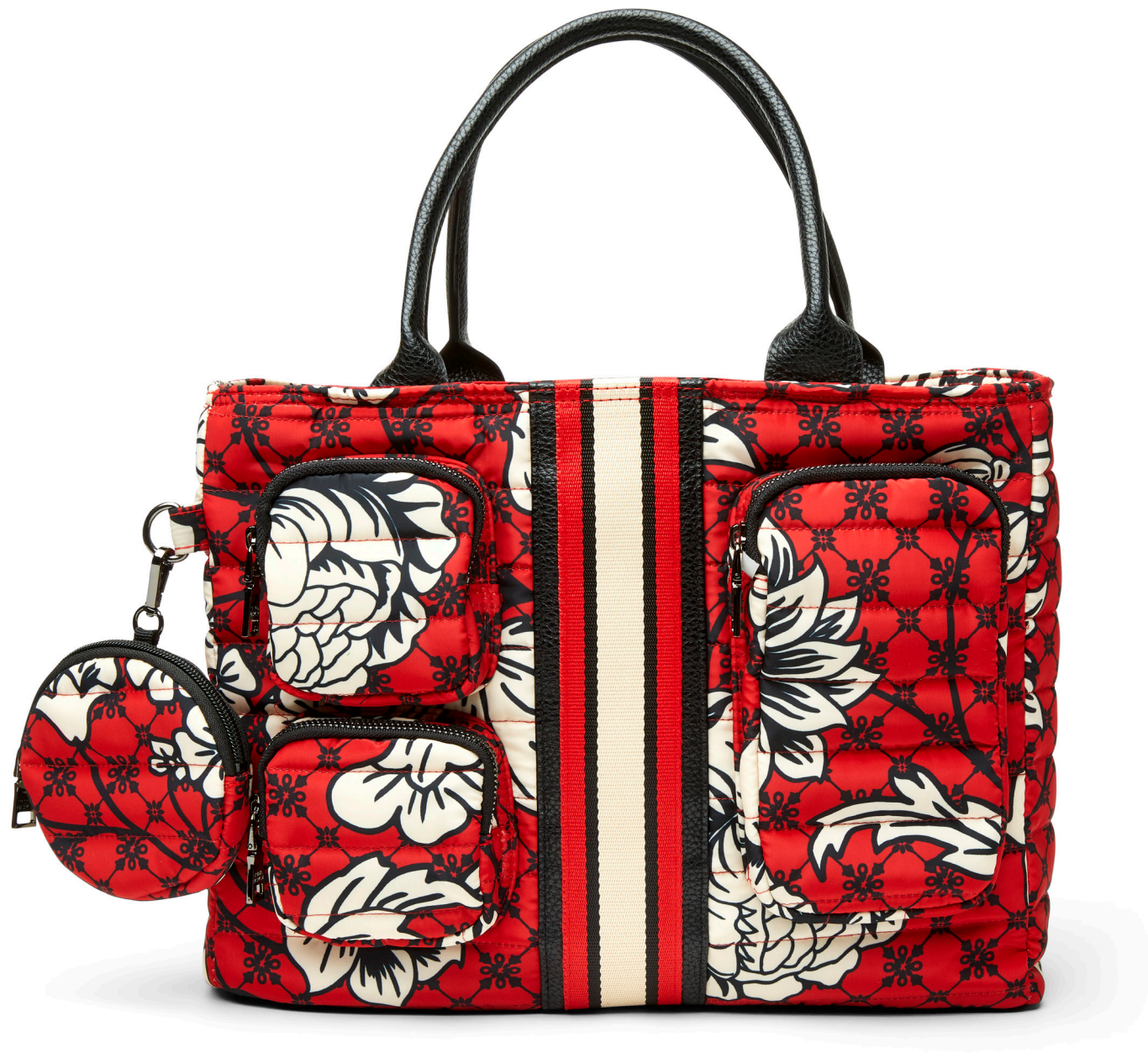
Lancaster Tote in Red Florent Floral | $198