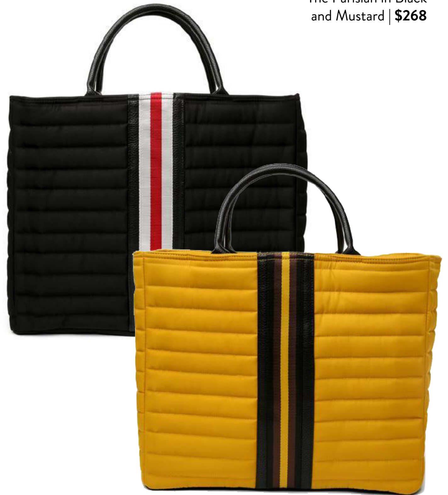
The Parisian in Black and Mustard | $268