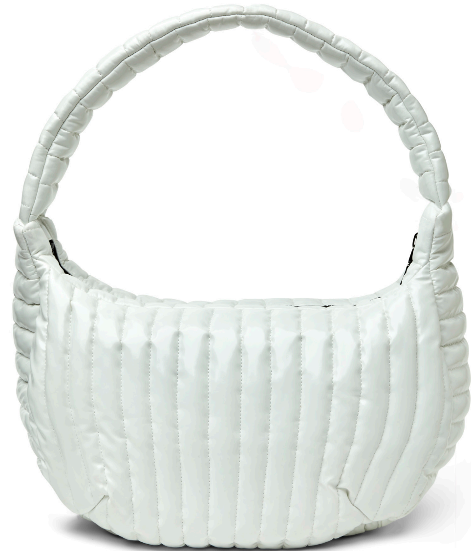
Meg Shoulder Bag in Pearl Emerald | $178 , Oversized Meg in Black Patent and White Patent | $178