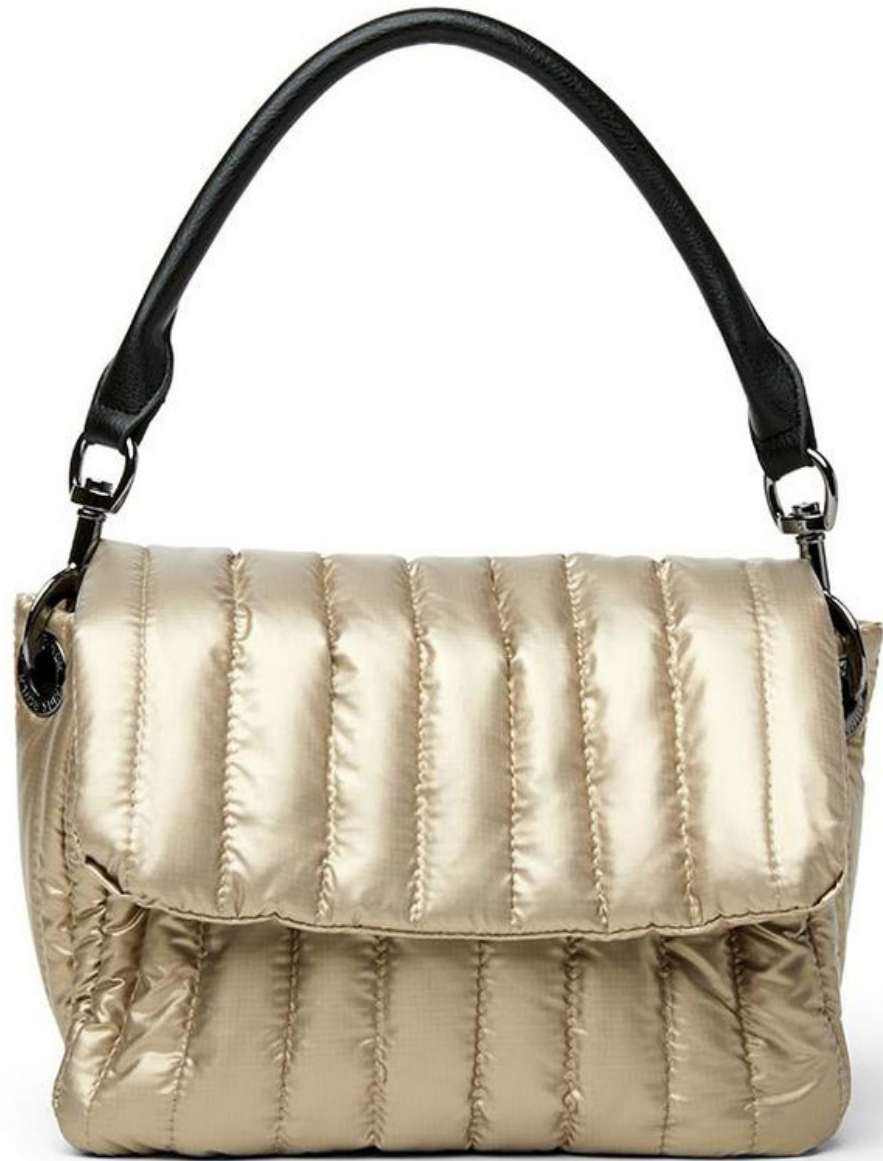
Bar Bag in Pearl Gold | $158