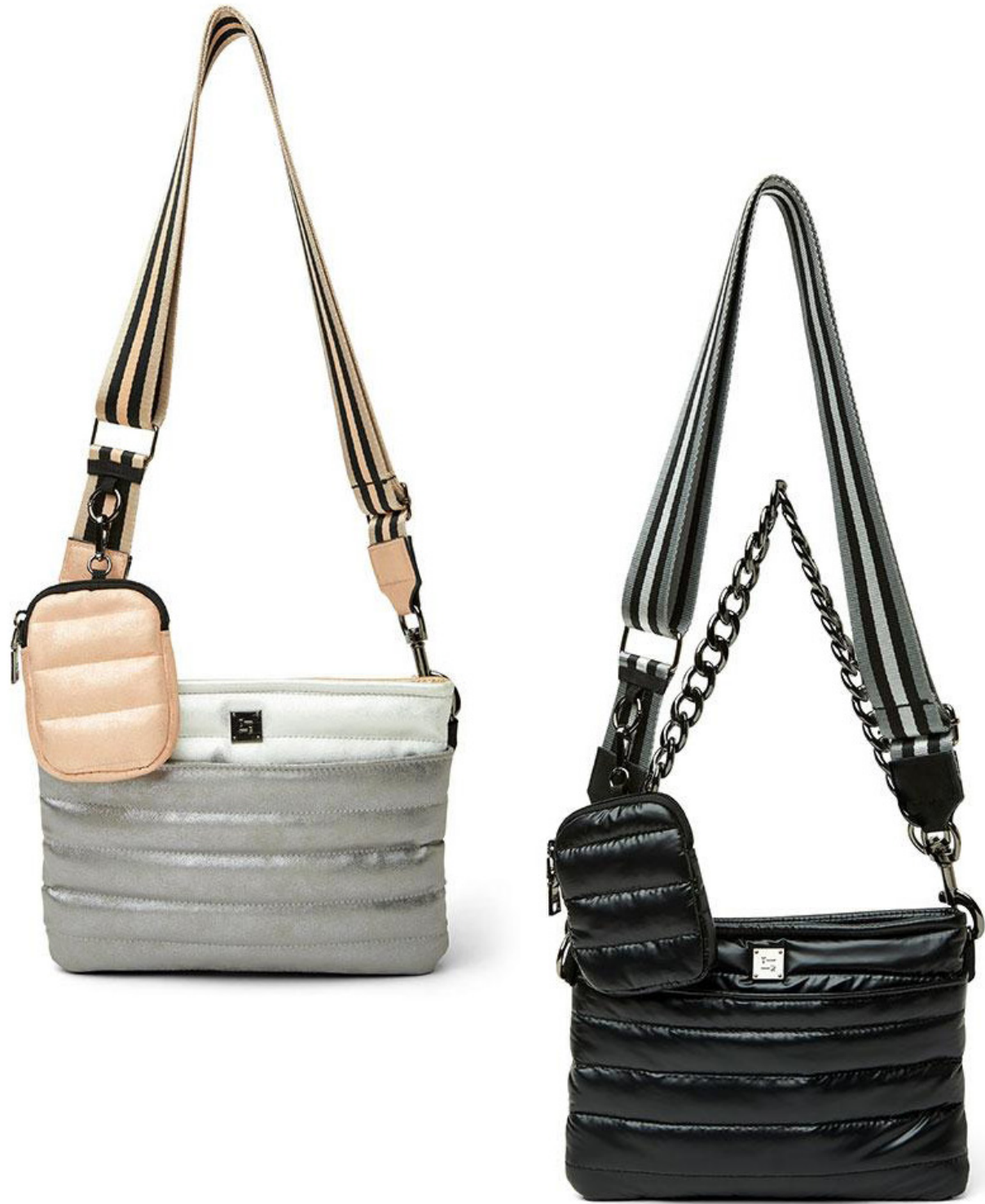
Downtown Crossbody in Luxe Multi Color Block ($164) and Pearl Black ($144)