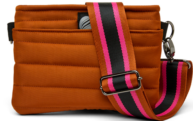
The Bum Bag in Black Camo, Pearl Emerald and Saddle | $78