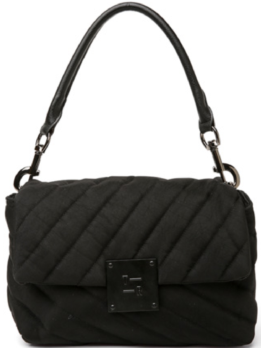
Limelight Bag in Black Flight | $238