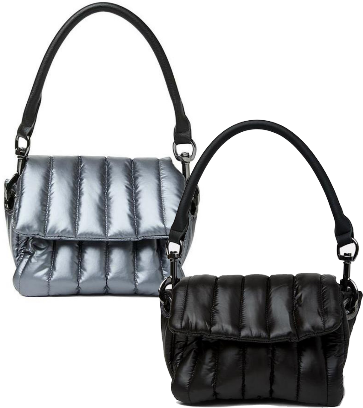
Petite Bar Bag in Pearl Grey and Shiny Black | $144