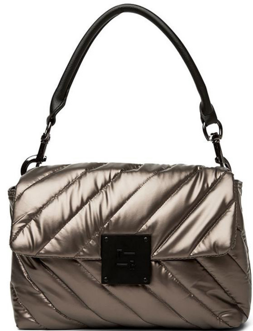
Limelight Bag in Pearl Pyrite | $238