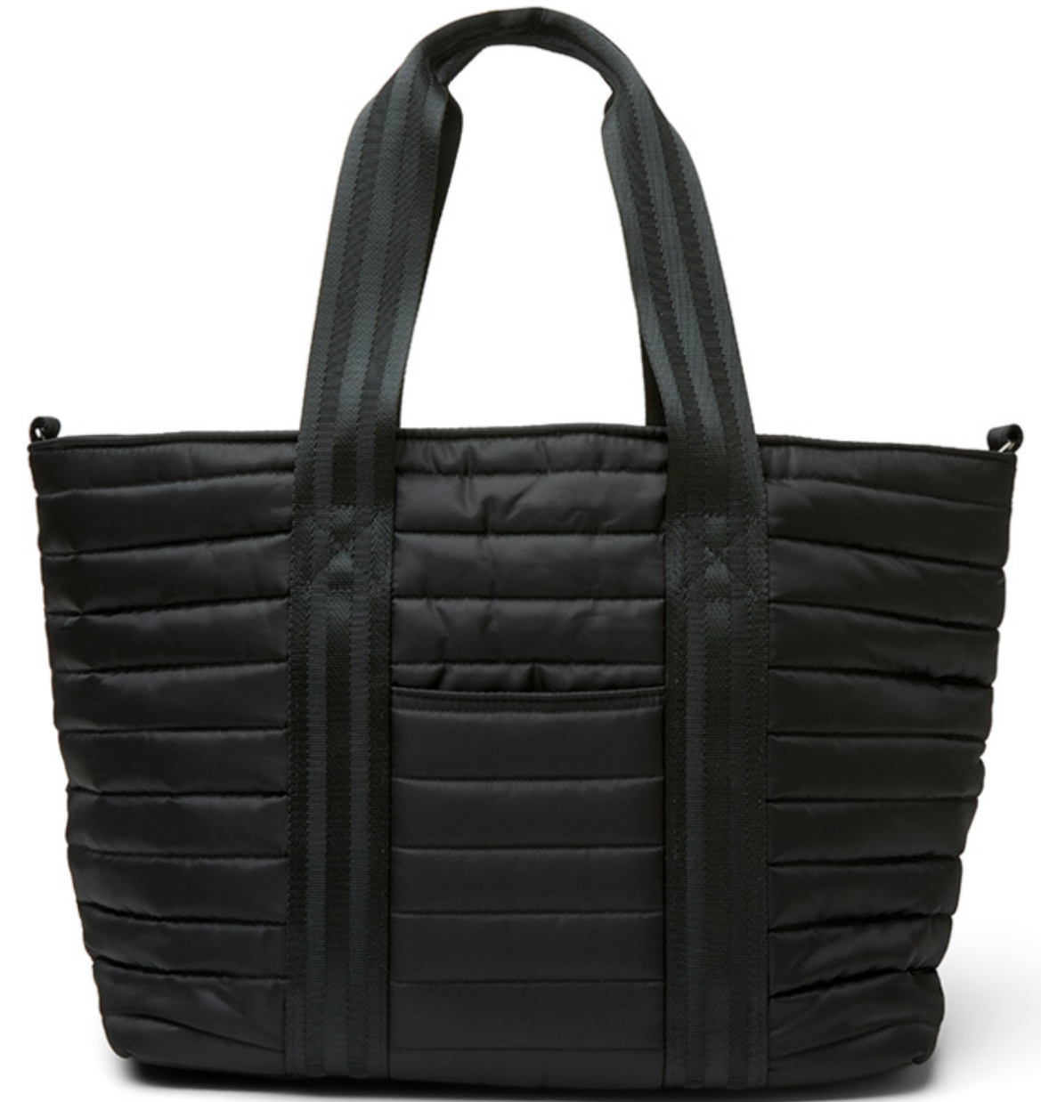
Wingman Bag in Black Flight Nylon | $178